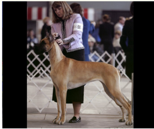
Envy - CH Windyhills Maitau Cosmic's Envy

~ Envy with her sons Rafferty and Titan ~