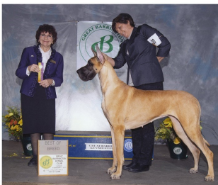
Roma GCH Cosmic Maitau's Eye'm A Star Barely Dressed, GDCA AOM

~ Harlow with her son Stallone and daughter Roma ~