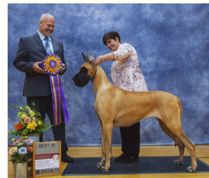
Roma MIBISS GCH Cosmic NoBonz I'll Leave You Starry Eye'd, GDCA AOM