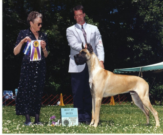
Teddy - CH Cosmic Thunderhills Fearless