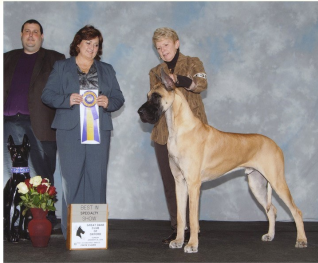
Trace BISS GCH Maitau N Cosmics Better By Design, CGC,RN, BN