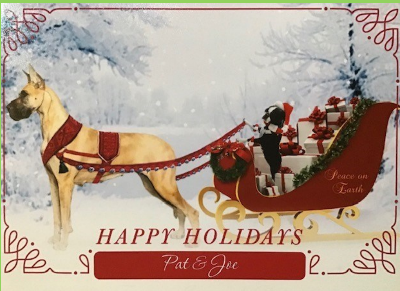
Below—Shea & Dooney