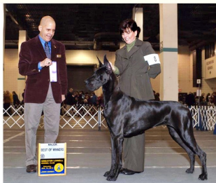
Harlow GCH JV Cosmic's I'll Leave You Star Struck, HR, ROM (Dam of 5 CH's), HOF