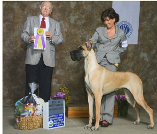
Arden GCH Maitau Cosmic Eye'm A Star In Style, HR, ROM (Dam of 8 CH's), 2xGDCA AOM

~ Fendi with her son Trace, daughter Arden and granddaughter Risqué ~