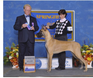
Risqué CH Cosmic Maitau's Designed For The Stars

~ Harlow with her son Stallone and daughter Roma ~