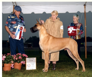
Max BIS MIBISS GCHS Cosmic NoBonz New Kid In Town, AOM