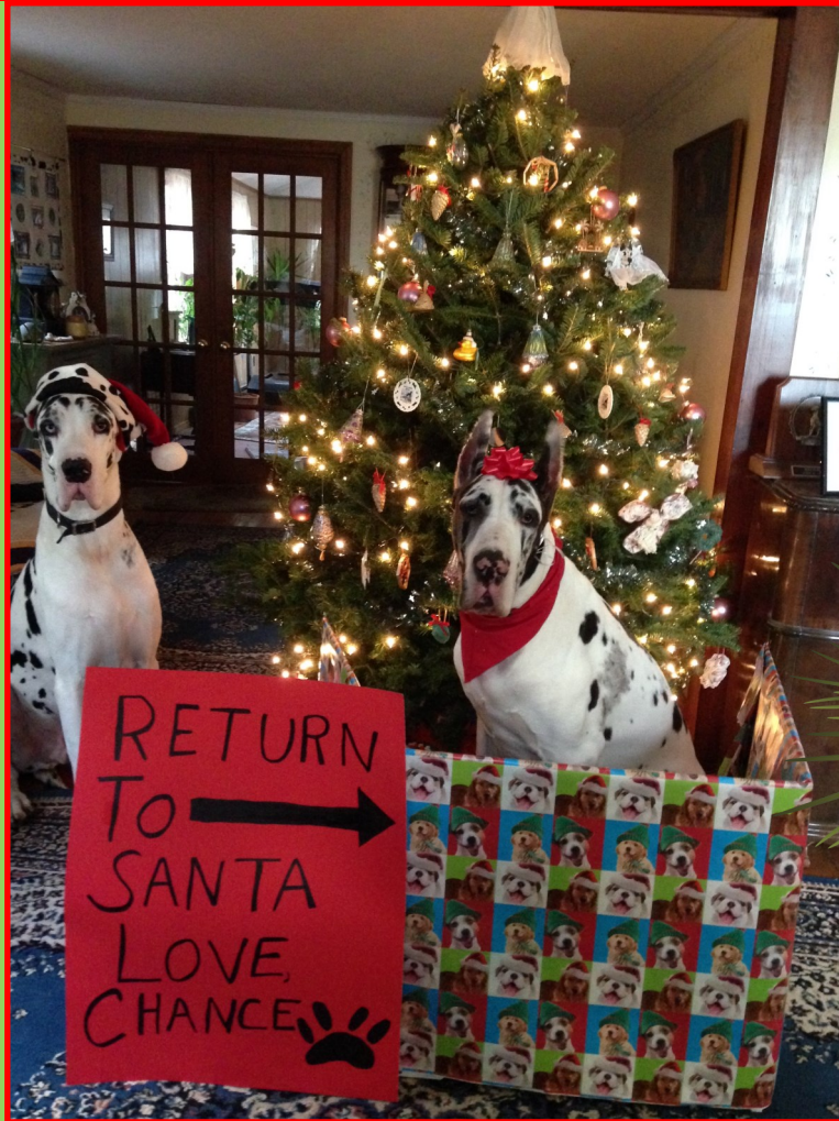
Buck & Chance